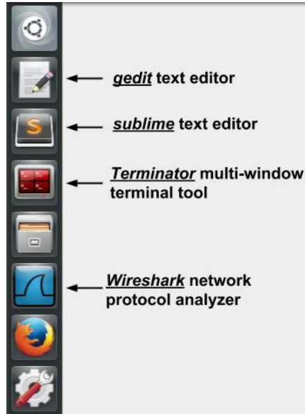
Figure 1: Application Shortcuts in the Launcher

The complete list of packages installed is provided in Section 6.2. Here we only highlight some of the most commonly used tool for SEED labs. They are already pinned to the launcher (see Figure 1) for easy access.